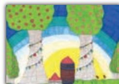
E3 Rosario, Wimauma