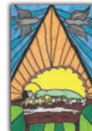
E22 Marbella, Wimauma