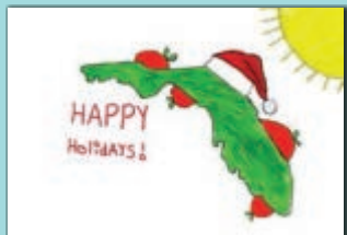
G2 Diego, Immokalee

May peace, joy and happiness bless your holiday season