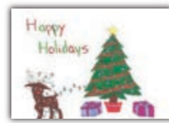
E11 Kimberly, Wimauma