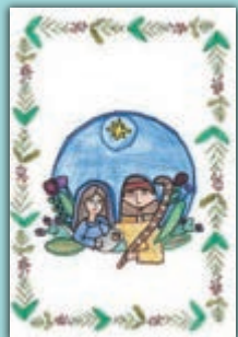
G1 Johanna & Sara, Wimauma

Enjoy these 3 designs from our general selection of non-exclusive Holiday cards. Each $15 package contains 10 cards with envelopes. See order form for details.