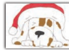
E12 Viviana, Wimauma