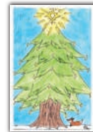
E35 Esteban, Wimauma