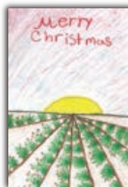
E25 Jamie, Wimauma