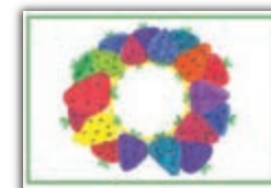
E7 Sierrah, Immokalee