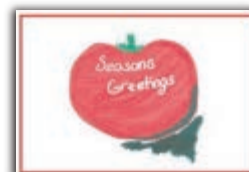
E6 Julyza, Immokalee