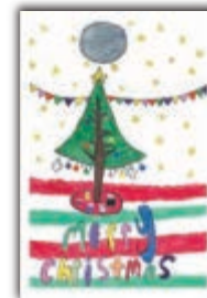
E27 Dravyn, Wimauma