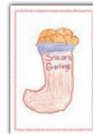
E28 Jazmin, Homestead