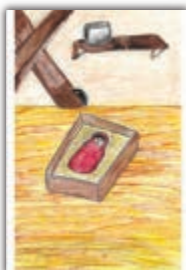
E16 Rocio, Wimauma