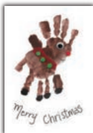
E23 Emery, Fellsmere